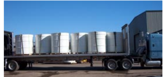
These TDOPs from a CPP supplier are ready for shipment.

T he CPP is managed by an integrated team under WTS Packaging Engineering direction. WTS participants include packaging engineering, quality assurance and oversight programs, waste handling engineering, procurement, and accounting. The team has processed orders in excess of $30M. These include approximately 3,300 SWBs, 6,500 TDOPs and 25 various lift fixtures. An expansion of the program is planned, with product additions to include pipe overpacks, standard large boxes and other specialized equipment.