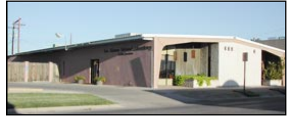
The LANL Carlsbad Operations office.

L os Alamos National Laboratory (LANL) plays a dual role in WIPP operations. Not only is LANL a major generator facility, projected to ship approximately 12,000 cubic meters of legacy CH-TRU waste to WIPP by 2010, and has significant ongoing TRU waste generation activities, but LANL is a project partner that has been involved in WIPP operations since 1994. In 2000, LANL expanded its participation at WIPP and the LANL Carlsbad Operations office (LANL-CO) was opened. Here is a look at the important role this organization fills at WIPP and beyond: