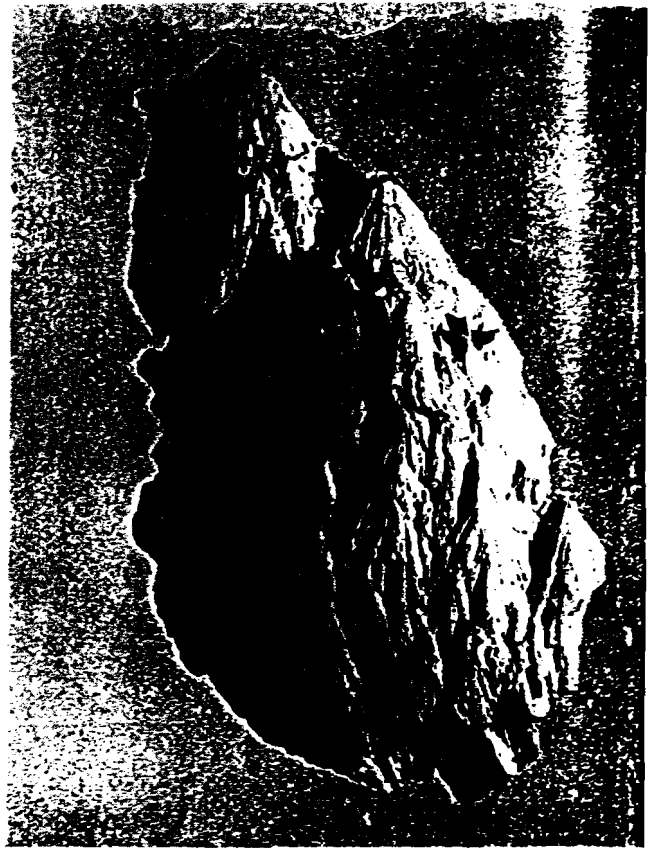
NEST OF CONES in dolomite, a type of limestone, is from Wells Creek Basin structure in Tennessee. This group is 11 inches high. Shock pressures generated by meteorite impact create such cones.