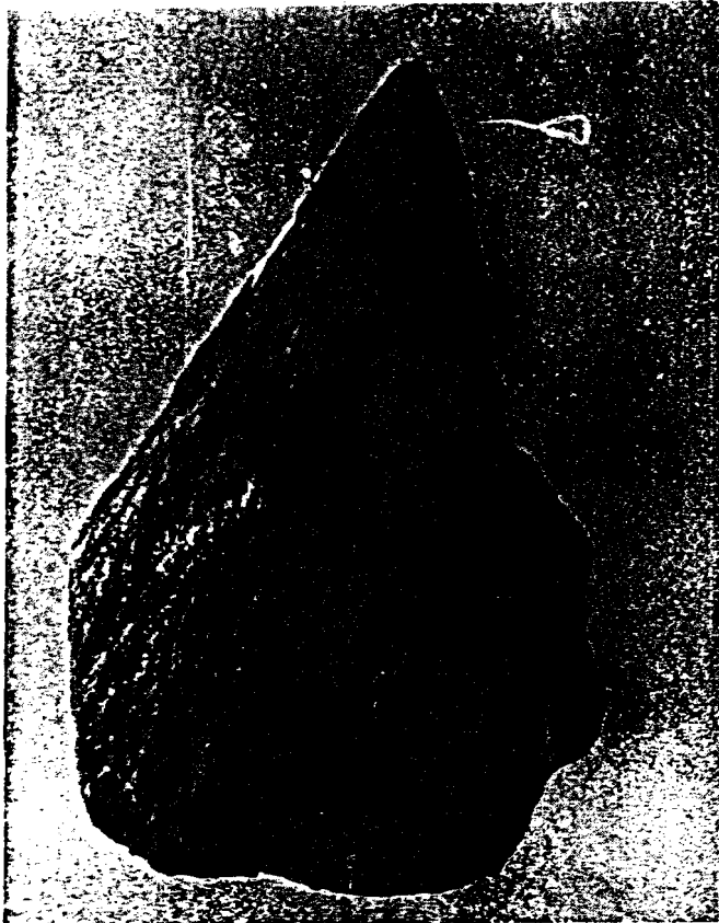
SHATTER CONE four inches high is one of many in igneous rock of the Vredefort Ring in South Africa, a structure that is probably the remains of the largest meteorite crater known on earth.