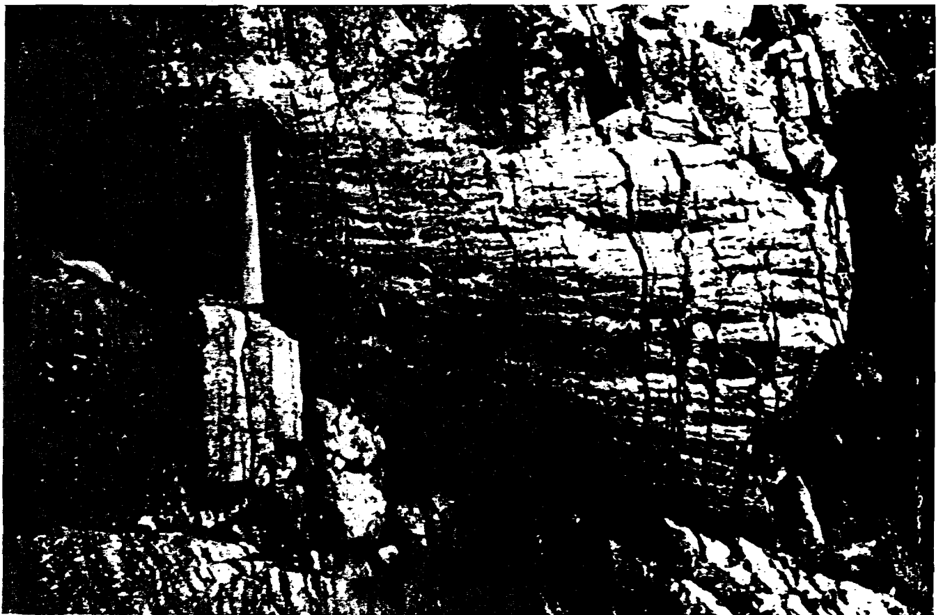
GIANT SHATTER CONE , over four feet long, is shown in place at the Kentland limestone quarry in Indiana. These cones found among jumbled rocks in a flat, geologically undeformed terrain indicate that the quarry is an ancient meteorite-impact site.