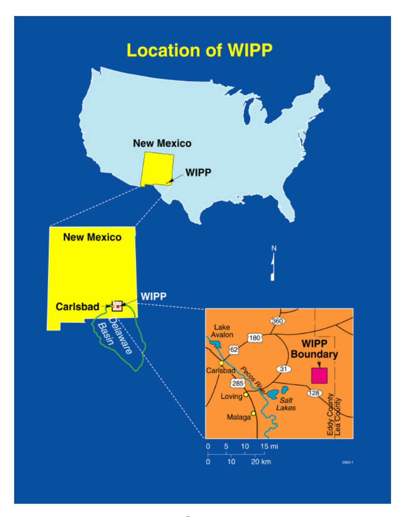
Figure 2-1 - WIPP Controlled Area