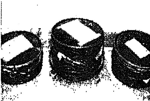
Figure 1. Compressed waste pucks as generated in the AMWTF

DOE states that approximately 52,440 100-gallon drums are expected to be shipped from INEEL to WIPP. DOE also estimates that compressed waste will occupy 19,875 m 3 or 11.8% of the 168,500 m 3 of the contact-handled waste inventory at WIPP. The compressed waste radionuclide inventory is estimated as 89,252 curies versus an overall repository total of 2.48 million curies (decayed to 2033). The compressed waste will have about ten times the density of cellulosic, plastic, and rubber materials than the average standard waste.