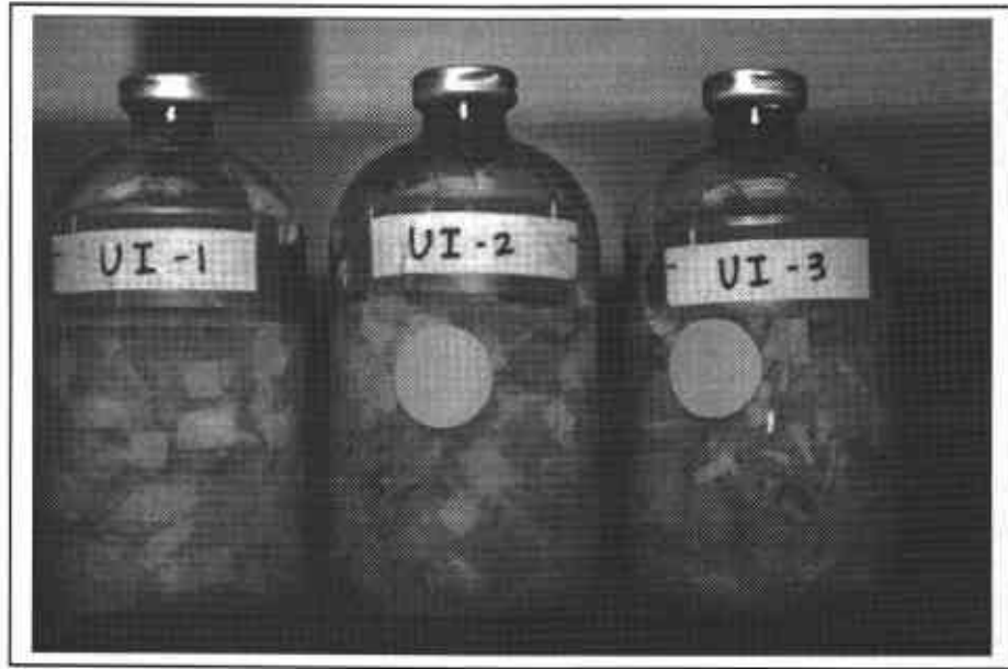
Anaerobic unamended inoculated samples contain paper that remains intact.