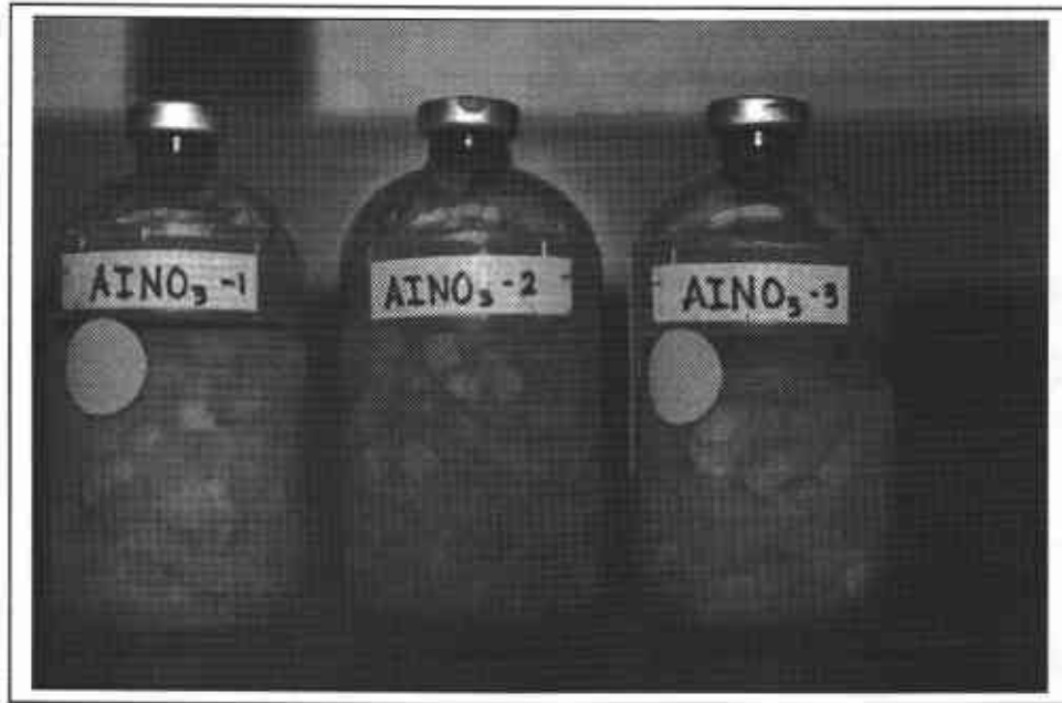
Anaerobic amended inoculated samples + excess nitrate contain paper that has been partially turned into pulp.