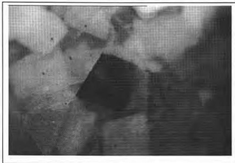
Blackening of paper in anaerobic unamended inoculated sample containing bentonite due to reaction of iron with biogenic sulfide.