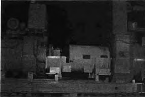
Shield plug being emplaced