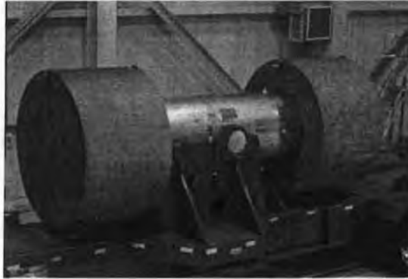
Figure 2. CNS 10-160B transportation cask.