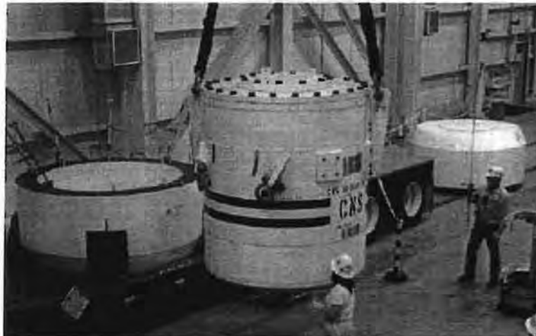
Figure 3. Drums from a CNS 10-160B being brought into the WIPP hot cell.